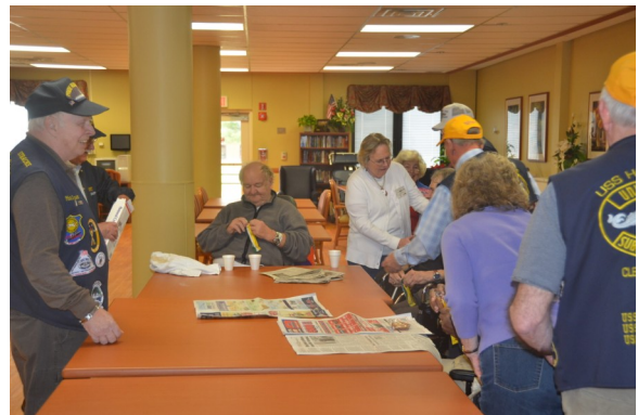
Passing out cookies & ice cream in one of recreation areas