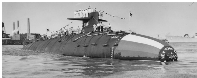
USS HADDO SSN604 Launched, Camden NJ., August 18, 1962